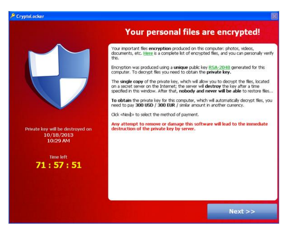
Figure 1. Cryptolocker's ransom demand screen

One of the most recent and most dangerous pieces of cryptomalware, the previously-mentioned Cryptolocker Trojan, also uses a public-key algorithm. After each computer is infected, it connects to the command-and-control server to download the public key, so another key, the private one, is accessible only to Cryptolocker's authors. Usually the victim has no more than 72 hours to pay the ransom before their private key will be deleted forever. It is impossible to decrypt any files without this key. Kaspersky Lab's products successfully detect this Trojan, but if the system is already infected, than nothing can be done with the corrupted files.